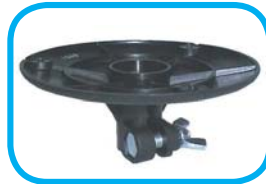
BD-106 Base adapter