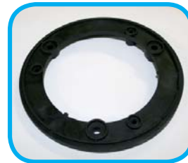
AD-015 Adapter base joint, slopy surfaces (angles up to 4°).