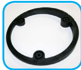
M-106 Adapter base joint, slopy surfaces (angles up to 4°).