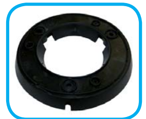
JB-015 Adapter base joint, curved surfaces.