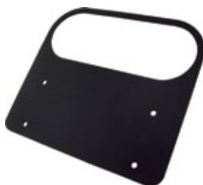
81522024 Fixation platen, 1 Microled Plus