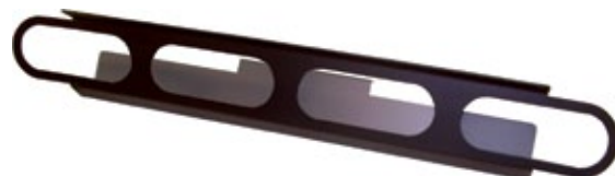
81522285 Set square, 4 Microled Plus, Renault Expert V.09