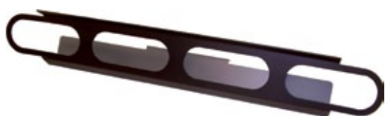
81522023 Set square, 4 Microled Plus, Seat Altea XL