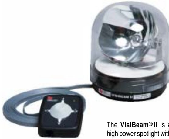
The VisiBeam® II is a high power spotlight with a handheld control unit.

For effective work area illumination, Federal Signal Vama's VisiBeam® II high power spotlight features a handheld remote control with pinpoint accuracy.