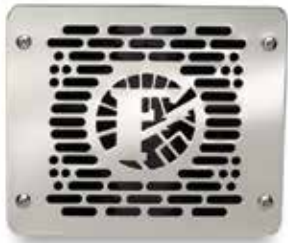
Flush mount with grille, ESFMT-EF

ESB-U Universal bail bracket, all vehicles ESB-V08 Ford Crown Vic Interceptor, 2002-2011 ESB-TAH08 Chevrolet Tahoe, 2008-2014 ESB-IMP08R Chevrolet Impala, 2006-2014 ESB-EXP07 Ford Police Interceptor Utility, 2013-2014 ESB-CAP11 Chevrolet Caprice, 2011-2014 ESB-TAR11 Dodge Charger, 2011-2014 and Ford Police Interceptor Sedan, 2013-2014 ESB-F113 Ford 150, 2013 ESB-TAH15 Chevrolet Tahoe, 2015 ESBMT-SB Bumper/Surface mount bracket ESFMT Recess mount, polished trim ring ESFMT-EF Recess mount, stainless steel "Electric F" grille